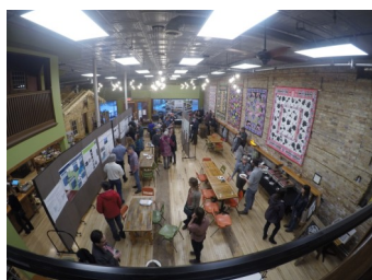
Poster night Science Symposium