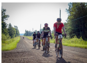
Bike the Heart -Neebing ON