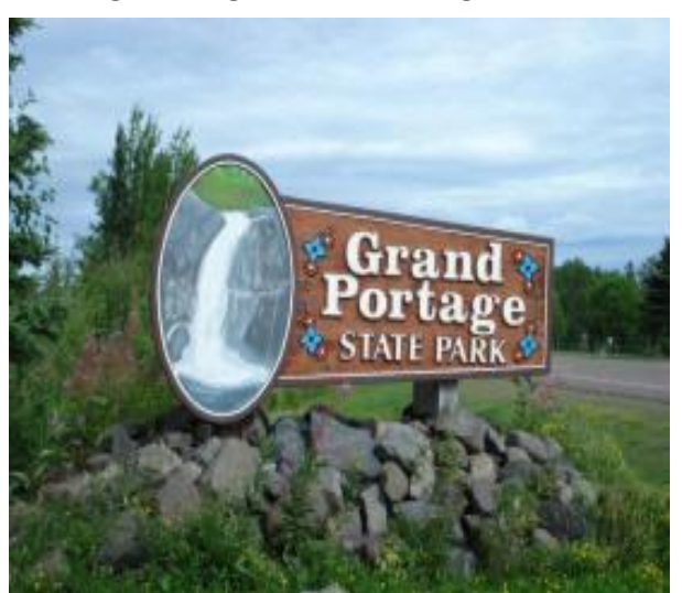
Great hosts and wonderful facility at Grand Portage State Park

Morning meetings at Grand Portage State Park