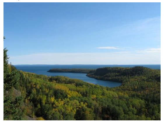
Big Trout Bay Nature Reserve

Presentation: "Private Land Conservation on the North Shore of Lake Superior - A Cross-border Success Story"