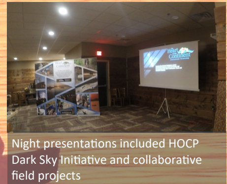
Night presentations included HOCP Dark Sky Initiative and collaborative field projects