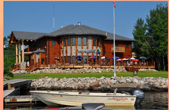
Crane Lake is a lovely unique community. It was a pleasure to meet some of the people from the town and the folks at Voyageurs were great hosts.

Heart of the Continent Partnership encourages becoming stewards of the places we love and connecting people to our public lands. Not only with sweat and hard work in the backcountry, but within the hearts and minds of the people that work, live and visit the Heart of the Continent.