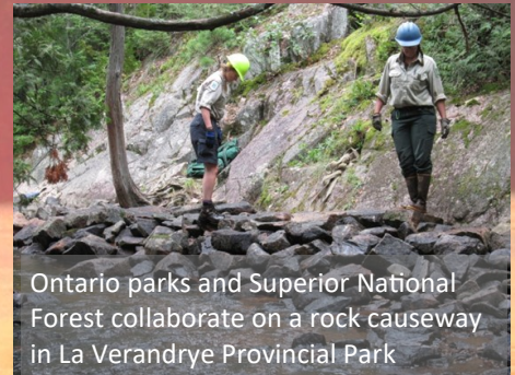
Ontario parks and Superior National Forest collaborate on a rock causeway in La Verandrye Provincial Park