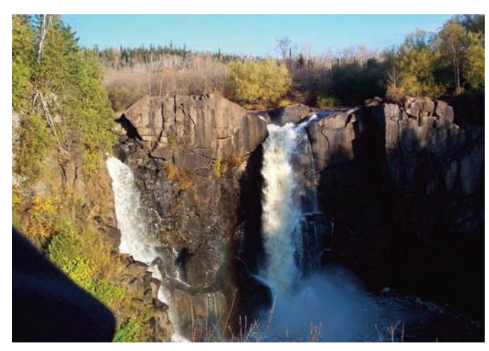
High Falls, Pigeon River Provincial Park

HOCP is developing a common identity and sense of belonging to the larger cross-border area, the Heart of the Continent, which consists of over two million